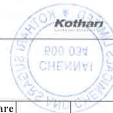
Table III: Statement showing shareholding pattern of the Public Shareholder